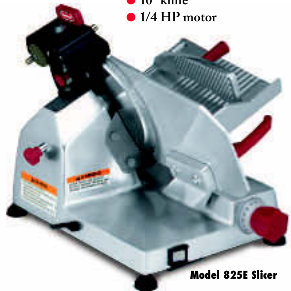
Model 825E Slicer