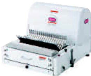
Model MB Counter Top Bread Slicer