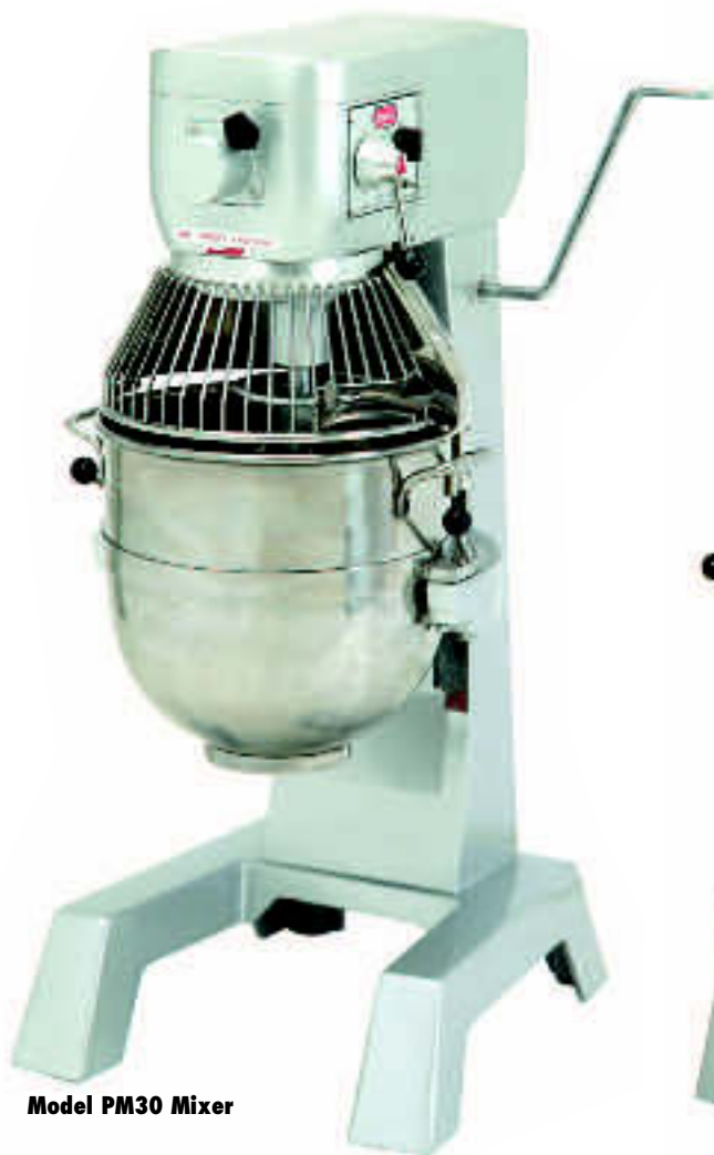
Model PM30 Mixer