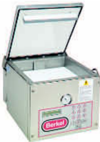
Model 350 Counter Top Vac Pack