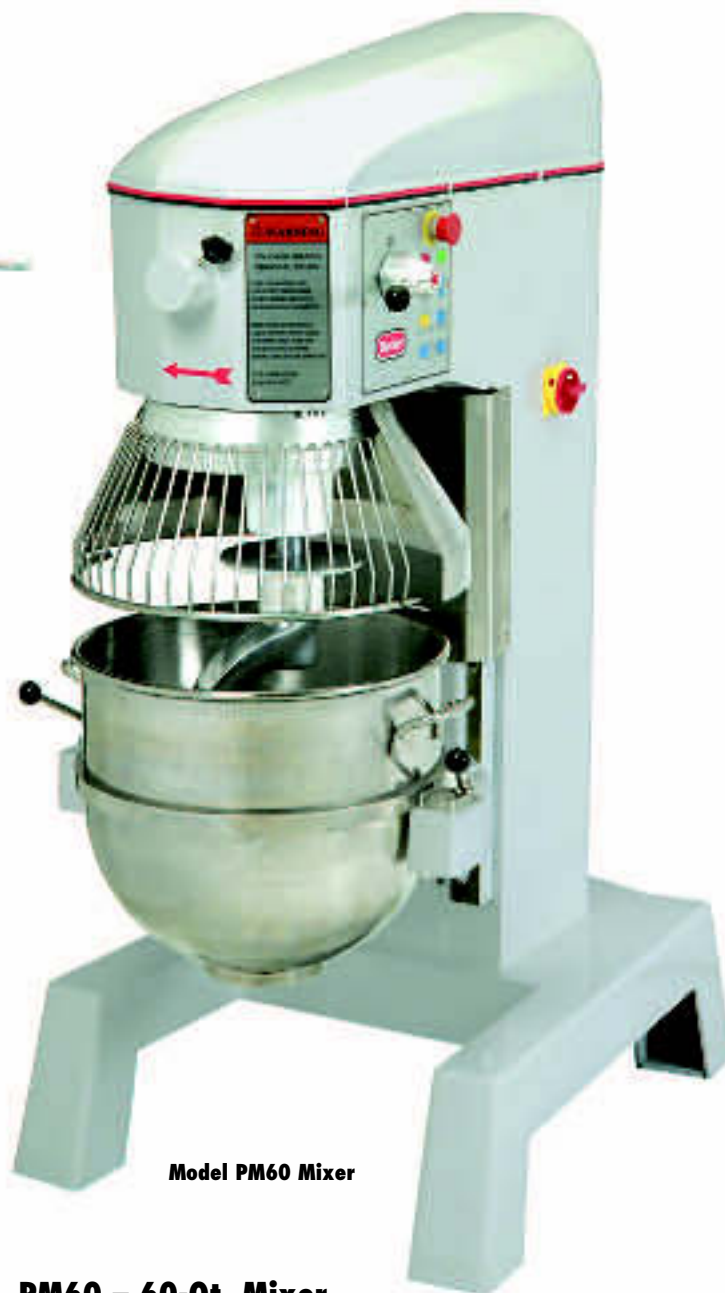
Model PM60 Mixer

These mid-size models are ideal for medium volume production. Perfect for larger foodservice and food retail operations. The manual bowl lift is self-locking in top position.