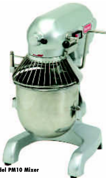
Model PM10 Mixer