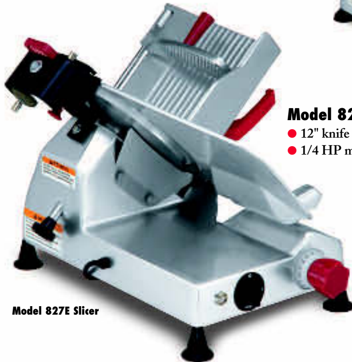
Model 827E Slicer