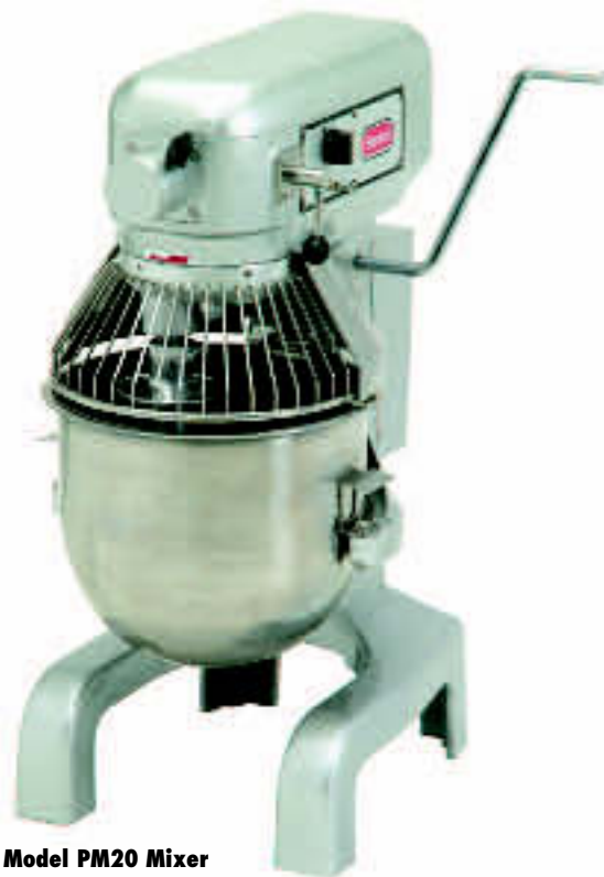
Model PM20 Mixer