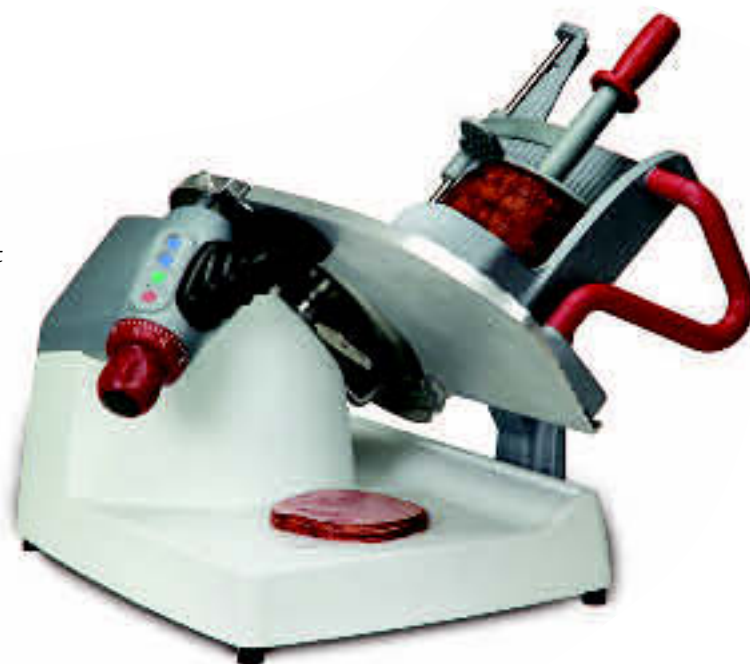
Model X13A Automatic Slicer