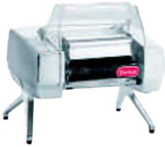
Model 705 Tenderizer