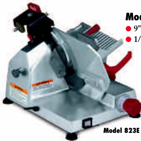
Model 823E Slicer